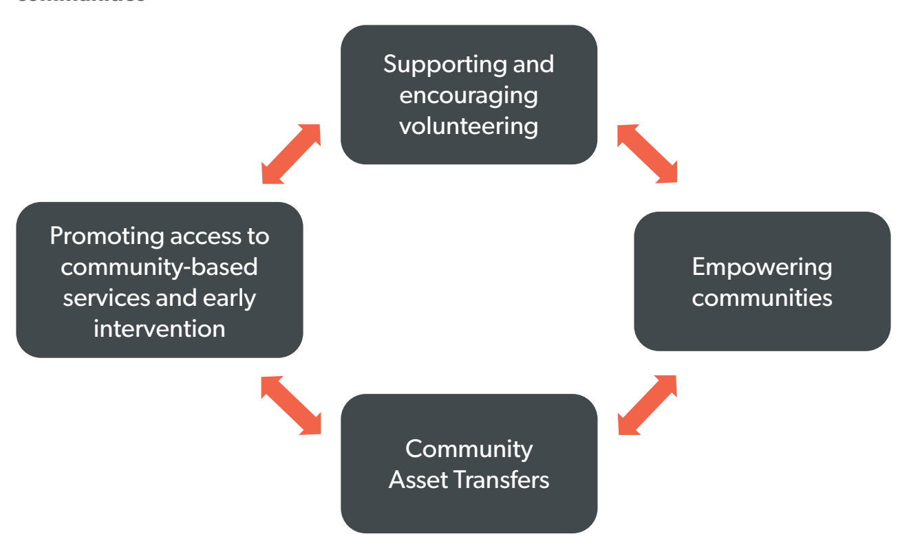
Exhibit 3: how local authorities are helping to create resilient and self-reliant communities

2.2 In terms of where local authorities have traditionally pitched their efforts in helping to build stronger and more self-reliant individuals and communities, their work in recent years has broadly fallen into one or more of the following areas – Exhibit 3 .